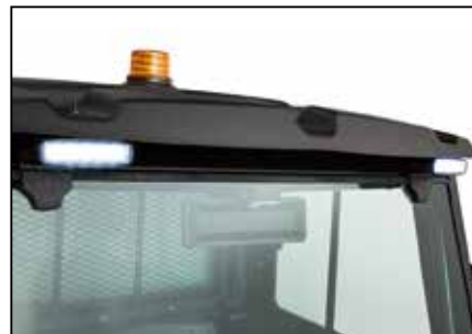
■ LED Front Worklights (x2) (RTV-X900 & RTV-X1120D only) VC5050