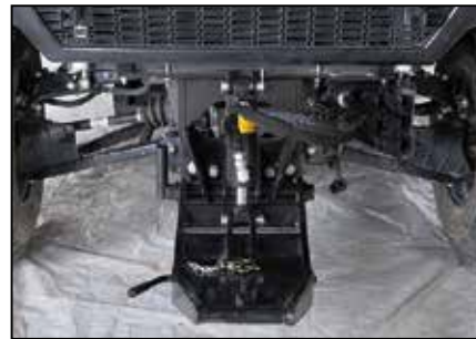
■ Front Hydraulic Quick Hitch V5289