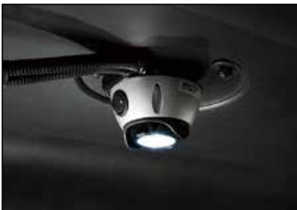
■ Dome Light (RTV-X900 & RTV-X1120D only) VC5053