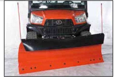
■ Commercial 72" Hydraulic Straight Blade V5290