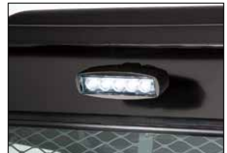
■ Rear Work Light (RTV-X900 & RTV-X1120D only) VC5051