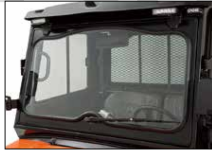
■ Laminated Windshield (RTV-X900 & RTV-X1120D only) VC5020