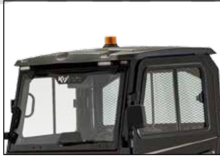
■ Plastic Canopy (RTV-X900 & RTV-X1120D only – Shown with VC5056 LED Strobe Light) VC5011