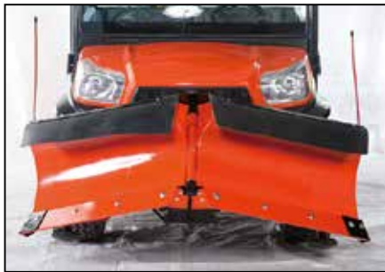
■ Commercial 72" V-Blade V5291