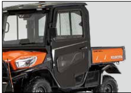
■ Metal Doors with sliding windows (RTV-X900 & RTV-X1120D only) VC5090 – Black VC5091 – Orange