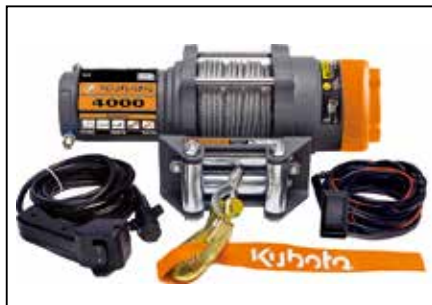
■ Winch Kit (4,000lbs capacity) V5244