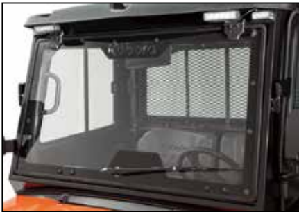
■ Poly Windshied (RTV-X900 & RTV-X1120D only) VC5023