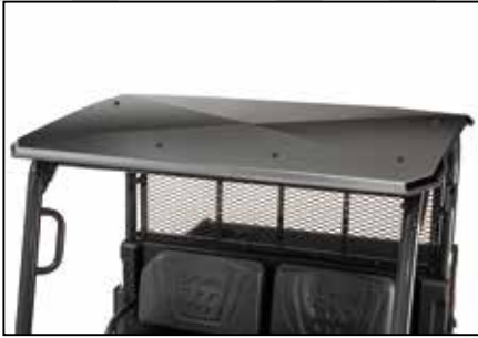
■ Metal FOPS Canopy (RTV-X900 & RTV-X1120D only) VC5000