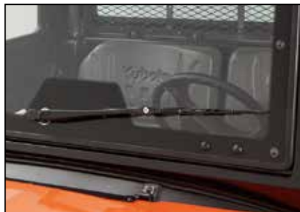
■ Wiper (RTV-X900 & RTV-X1120D only) VC5030