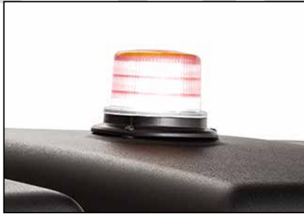
■ Strobe Light VC5056 – RTV-X900 & RTV-X1120D VC5058 – RTV-X1100C