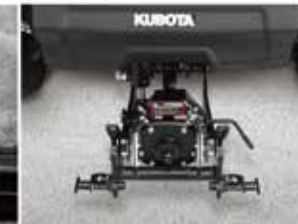
4 point hitch