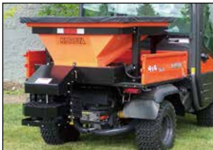
■ Cargo Box Spreader (RTV-X900 & RTV-X1100C only) V5005