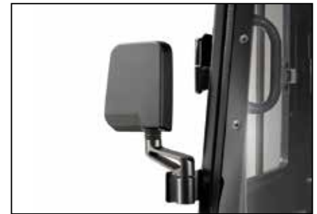
■ RTV Mirror Kit (RTV-X900 & RTV-X1120D only) VC5076