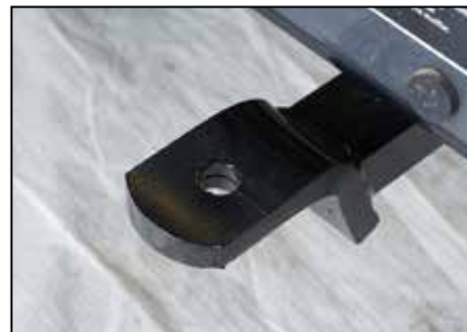
■ Trailer Hitch Ball Mount Kit V5200