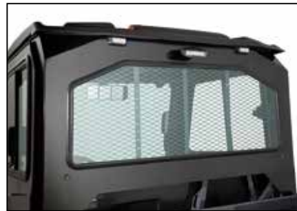
■ Rear Panel (RTV-X900 & RTV-X1120D only – Shown with optional rear worklights and flashers) VC5040