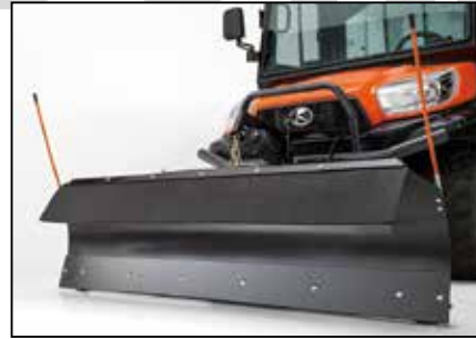
■ 72" General Duty Straight Blade with Quick Hitch V5008