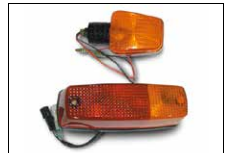
■ Turn Signal/Hazard Light Kit V5237