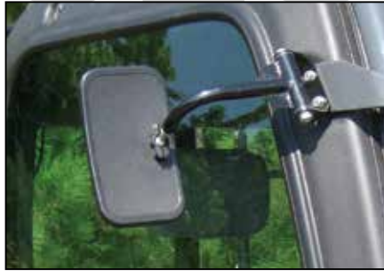
■ RTV Mirror Kit (RTV-X1100C only) V5059 – Cab