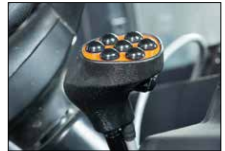
■ Hydraulic Control & Valve System V5232 – 2-function Control & Valve V5233 – 3-function Hydraulic Valve Upgrade Kit (not shown)