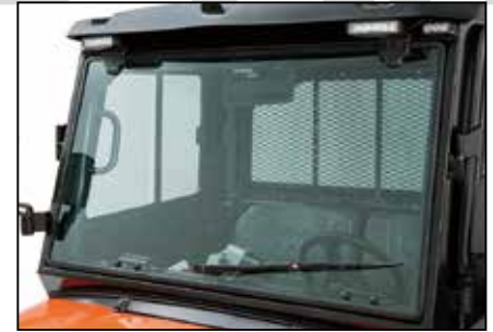
■ Tempered Glass Windshield (RTV-X900 only) VC5025