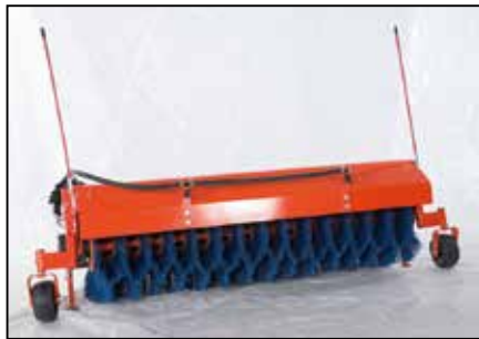
■ 60" Hydraulic Rotary Broom V5260